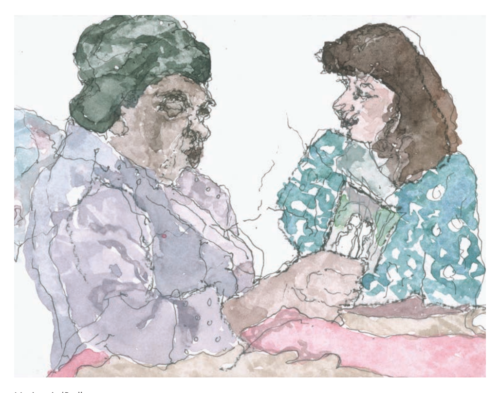
Musings in 'Bed'

Competition and envy are alive and well in the event. Images of young people, colours, gardens, privilege and the anger of the deprived, the outsider, good fortune, working hard from nothing to get where I am, introduces competition of who is who in the hierarchy of the event, who is healthier; who has done better in life; and who is smarter. Competition, anger and envy are part of the experience of ageing especially in relation to young people. Everyone became very lively on the generative possibilities of competition, jealousy and envy. They provide a liveliness and a reason to keep going, even if only to try to defeat the other. Do we need competition as we age? Often we remove ourselves from it, but do we really let it go? It seemed easy to evoke it – in the event the main expression of competition was left to foreign participants. For older people, the joys of life reduce down to relationships with partners, with worrying thoughts in the background, often not spoken about, of death and loss. 'If I lost her, I would feel suicidal. She is somebody who always receives me.' People who had lost partners or family in the Holocaust talk about their sadness and their regrets that they had not talked about death together beforehand. They talk about having to mourn and let go and adapt and develop a resilience to cope with whatever happens.