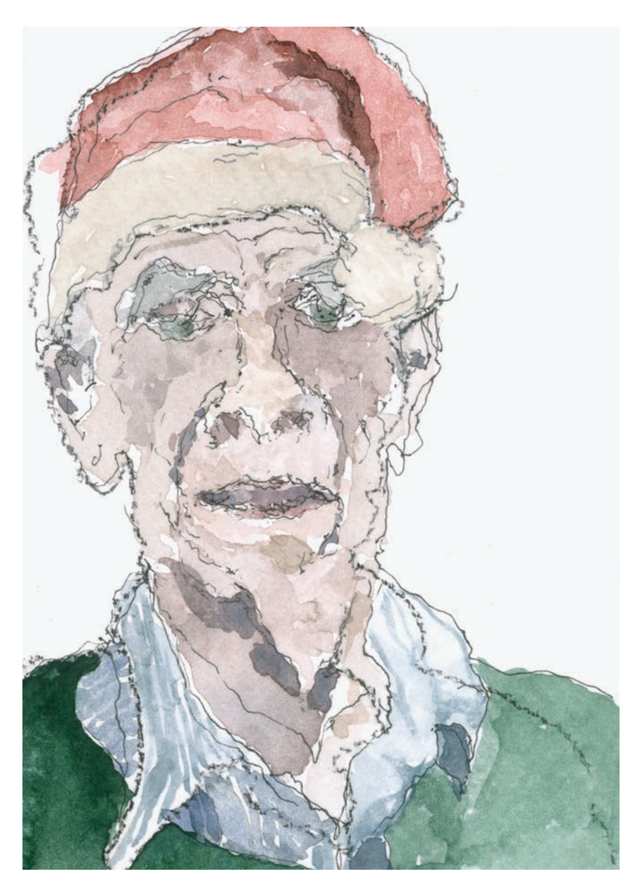
Pops at Christmas

keep working to support the public health and care services for an ageing population in greater need than ever before? Where do older people locate themselves in their working lives? Does it change over time or do we try holding on to what was before? In the Life Stories part of the programme, many stories involved changes of profession over the years, developing new areas of interest, responding to changed circumstances. Success in an older age seemed to relate to a capacity to adjust, to seek out the new, to make something of what comes along.