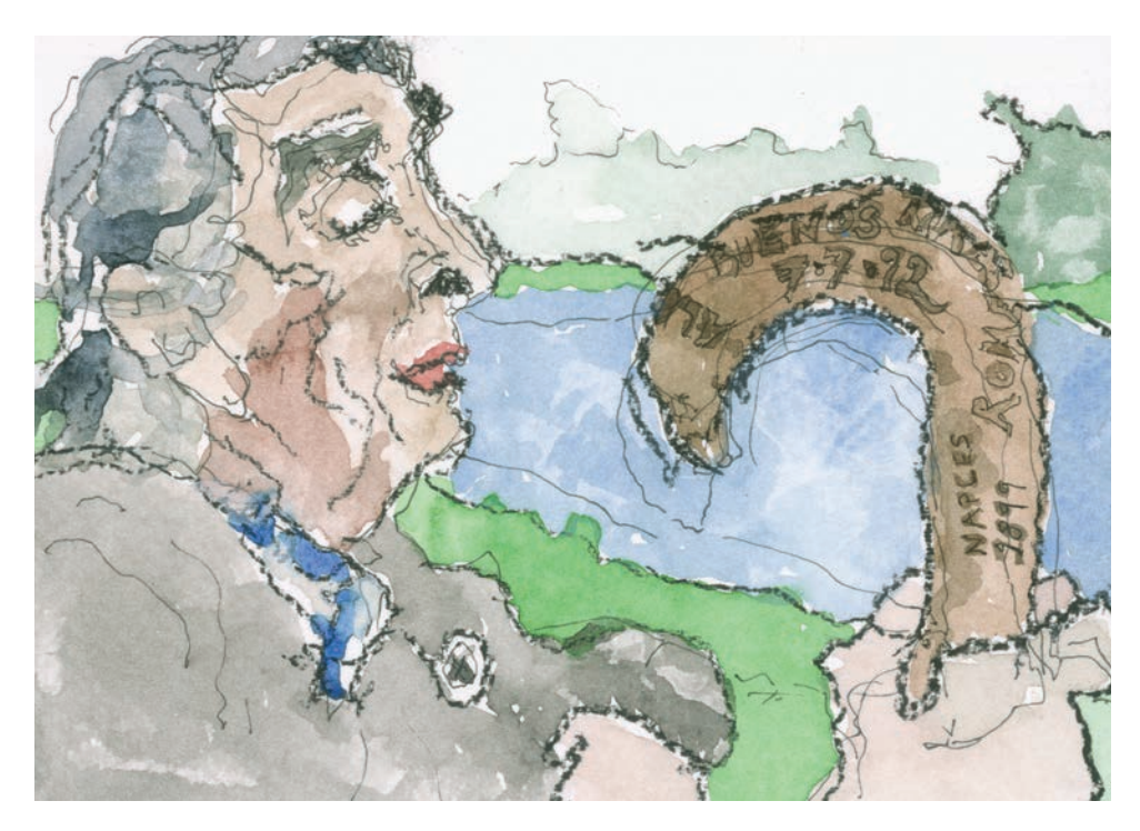
My 1892 walking stick